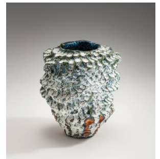
Spring Snow 17-7 Hoshino Satoru, 2017 Glazed stoneware