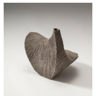
Single Flower Vase Hoshino Kayoko, 2017 Ash glazed Stoneware