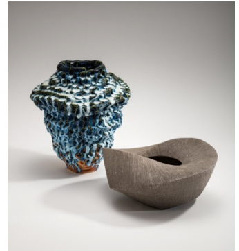
Back Left: Spring Snow 17-4 by Hoshino Satoru Front Right: CUT OUT Circle 17-7 by Hoshino Kayoko

As she explains: “My work starts with mixing several kinds of clay and by slapping and kneading, creating a mass of clay in an undefined shape. Mesmerized by the movement of clay itself, using a wire, I attempt to cut out the hidden, unexpected form within. It is the revelation of that inner form that endlessly inspires me.”