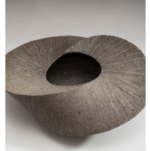
CUT OUT circle 17-6 Hosino Kayoko, 2017 Ash-glazed stoneware

The austere elegance of her work contrasts dramatically with that of her husband. Her distinctive sharply contoured wire-cut forms feature matte gray surfaces covered with vertical impressions made from metal tools to create a rhythmic linear pattern punctuated by dark crystallizations in the clay itself. Occasionally featuring a silver or ash glaze to emphasize a contrasting smooth surface, the duality of her approach to surface reflects her distinctive sensibility, which has brought Kayoko to the forefront of women ceramists on a global stage.