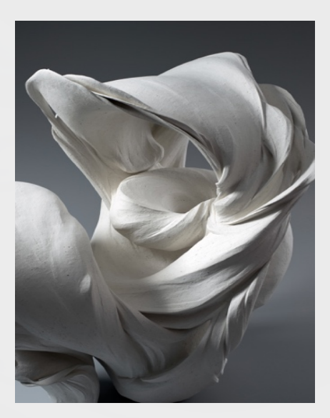
Ascending to Heaven (detail), 2018 28 x 26 x 19 3/8 in.