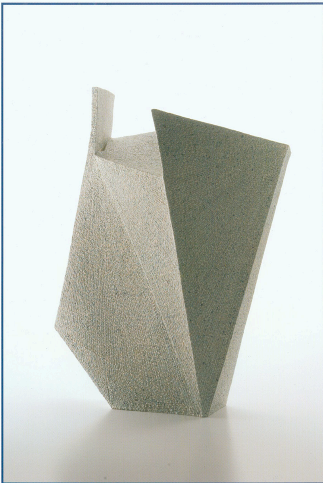
Saiseiki zōgan nōkata 22 1/4 x 16 1/8 x 6 3/4 inches 2007