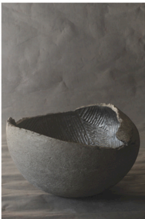
Vessel with metallic glaze 8 3/4 x 14 5/8 x 16 5/8"

Cover: White stoneware vessel with torn mouth and blue glass glaze 4 3/4 x 11 7/8" Back: Red vessel with roughly hewn lip 8 1/4 x 13 x 14 1/4"