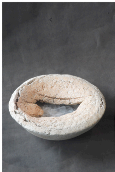
White vessel with clear glass glaze 5 1/2 x 14 5/8 x 15"