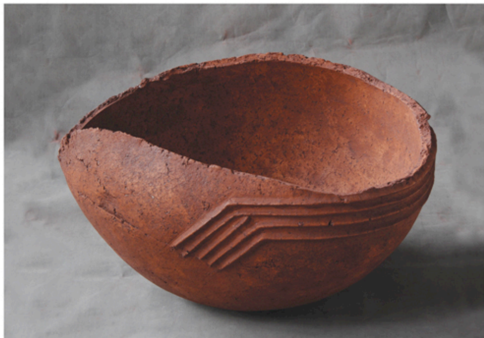
Red vessel with linear motif 10 1/4 x 17 3/8 x 19 3/4"