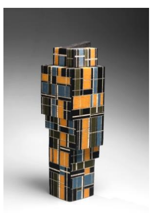
SAWADA HAYATO (b. 1978) Tokyo 2019 Glazed stoneware 18 3/8 x 11 5/8 x 14 3/4 in.

JAPANESE ART Antique – Contemporary 39 East 78th Street, 4th floor | New York NY 10075 Telephone 212 799 4021 | www.mirviss.com