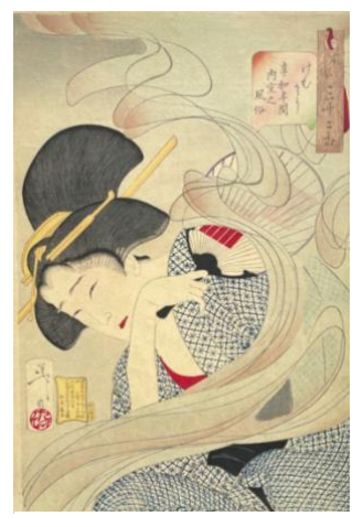
TSUKIOKA YOSHITOSHI (1839-92) Looking Smokey: A Housewife of the Kyöwa Era 1888, 5th month Oban tate-e