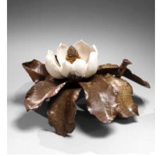
SUGIURA YASUYOSHI (b. 1949) Magnolia Hypoleuca 2016 Glazed stoneware 8 5/8 x 18 1/8 x 18 1/2 in.

Nowhere is the utter transformation of clay more evident, however, than in the flower forms of Sugiura Yasuyoshi (b. 1949). Sugiura's stunning, oversized summer blooms appear complete with delicate petals, curling leaves, and individual stamen.