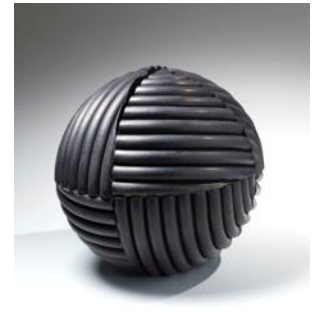
IMAI HYŌE (b. 1951) Kokutō; "Black Work" 2015 Black smoke-infused stoneware 14 1/8 x 16 7/8 x 15 in.