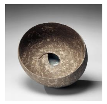
ITŌ TADASHI (b. 1952) Ocean Mist 2012 Glazed stoneware 8 1/2 x 12 1/4 x 11 in.

Alongside these remarkable sculptures, we present a group of ukiyo-e prints by renowned masters such as Ohara Koson (1877-1945) and Tsukioka Yoshitoshi (1839-92). Also on display is a two-fold screen by Nagasawa Rosetsu (1754-1799), whose masterful composition of a large flock of animated, swimming ducks is perfectly balanced with an open, unpainted sky.