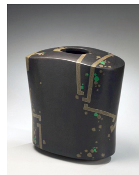
Morino Hiroaki Taimei (b. 1934) Flattened patterned vessel 2010 Glazed stoneware 13 x 12 x 6 1/2 "