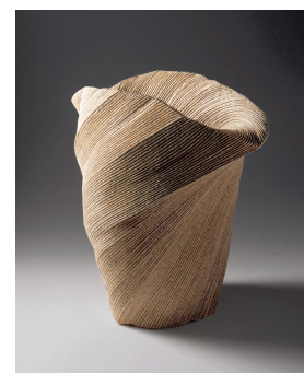
Sakiyama Takayuki (b. 1958) Chōtō ; Listening to Waves 2007 Glazed stoneware 22 1/2 x 23 x 17 3/8 "